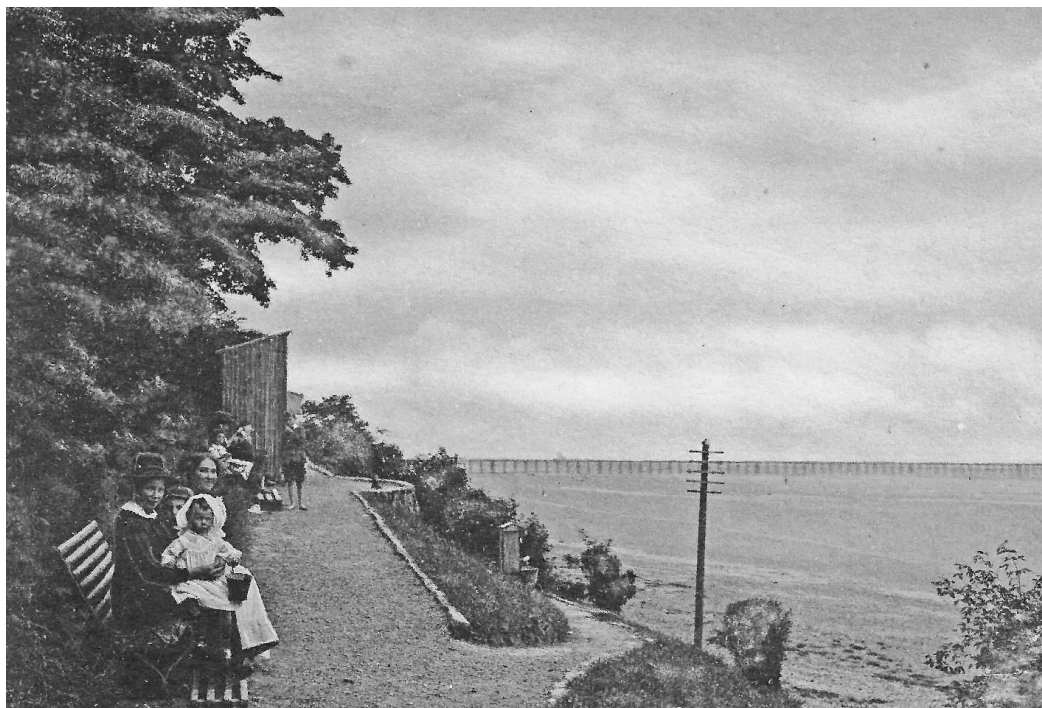
The Banks, Bowness-on-Solway

For further information on the Remembering the Solway project, including transcripts and extracts from the audio recordings of the interviews, visit www.solwaywetlands.org.uk