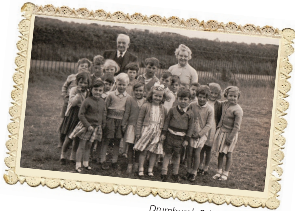
Drumburgh School, 1958

was a hired man in the house and Granny sometimes came to stay because she went from place to place to stay... They came from the North East... And the mother of one of them lived next door with a younger child. They were very nice people. And some of them stayed over and they shared the school. So it must have been jolly squashy in the school. And of course you didn't know what they were talking about because of their different accents. But it would be the same for them because they wouldn't know what we were talking about. And they used to tease me. And my mother was given... money to care for them. And I think she didn't really know what to do with it and she bought them a lot of comics every week. And so I benefitted from that. So I got to see the comics too."