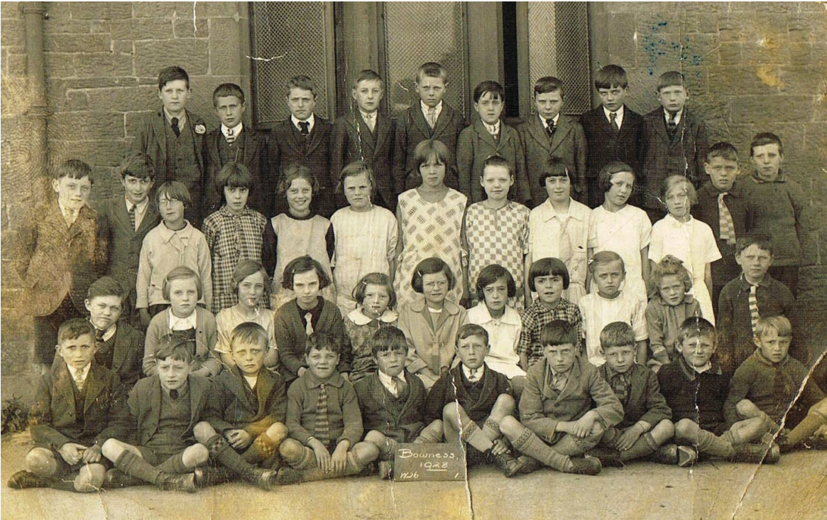
Bowness School, 1928