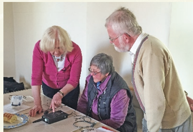
Using the recording equipment