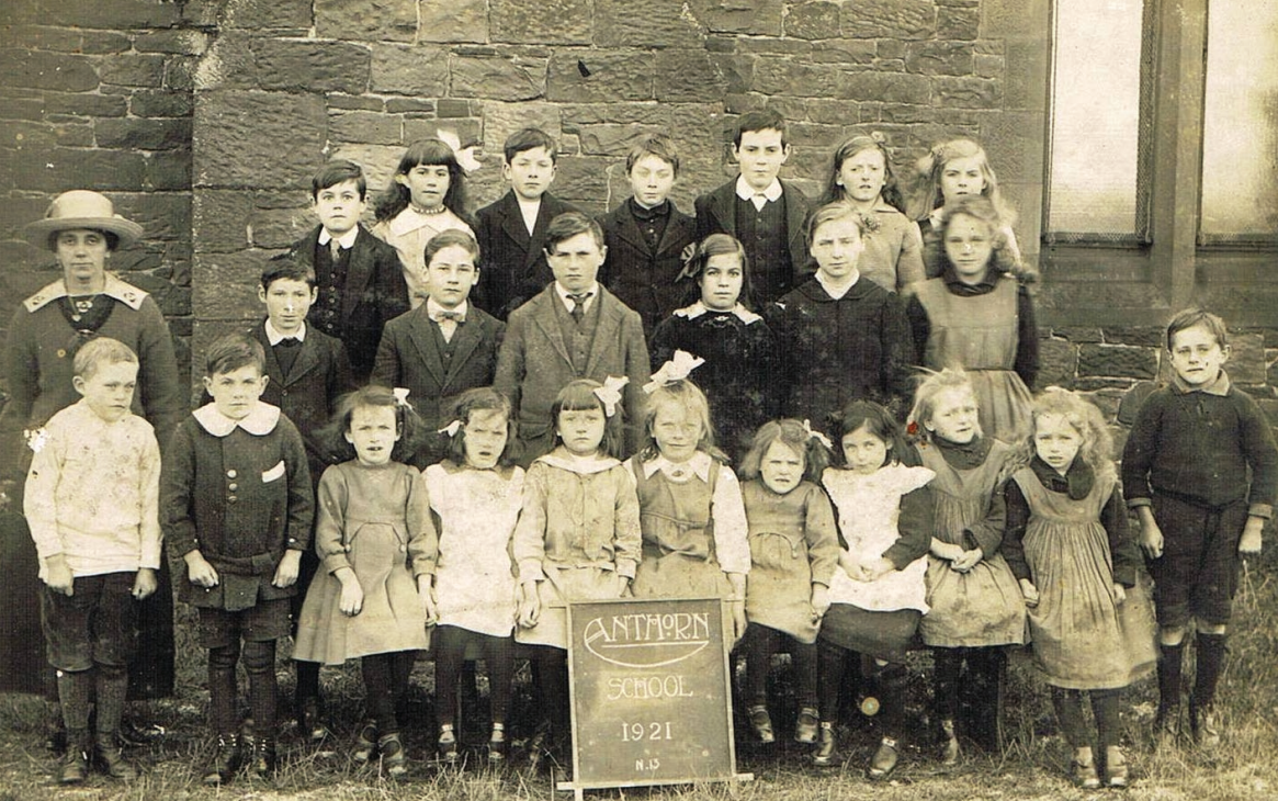
Anthorn School, 1921