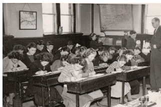
Kirkbride School, 1950

Eventually, the outbreak of war meant that new encounters were made with children from far off places with very different lives.