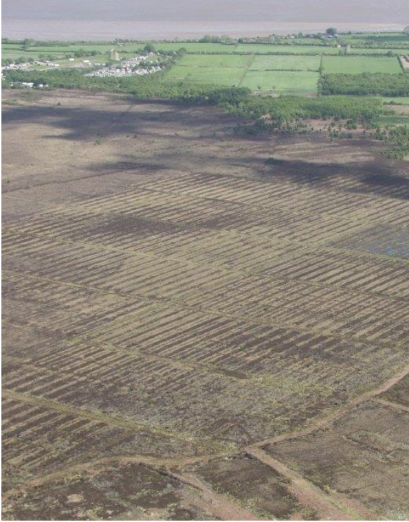
Old workings on Glasson Moss