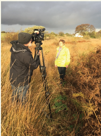
Filming on Whiteholme